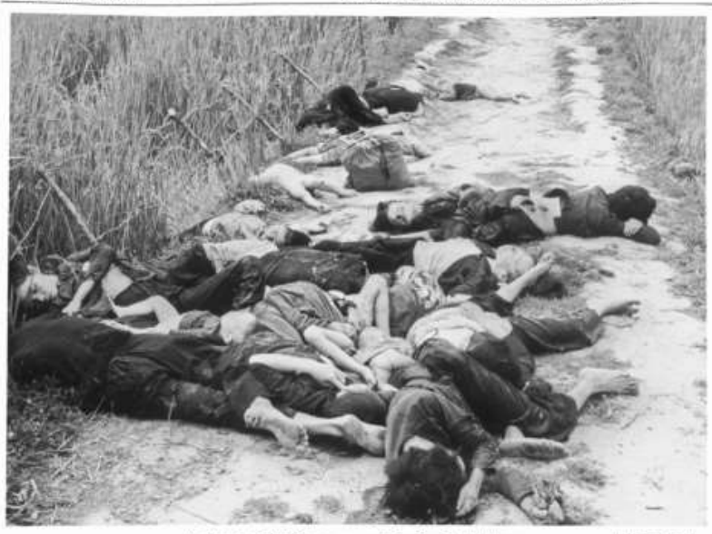
A clump of bodies on a road in South Vietnam.

OHIO'S LARGEST NEWSPAPER CLEVELAND, THURSDAY, NOVEMBER 20, 1969