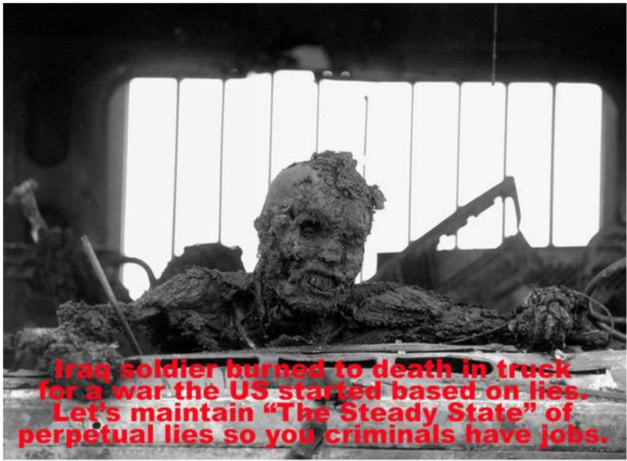
1992

<u>GHCQ whistleblower who exposed the lies that lead to the Iraq War</u>: "I work for the British people. I do not gather intelligence so the government can lie to the British people."